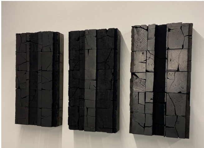
December in my eyes (Triptych)